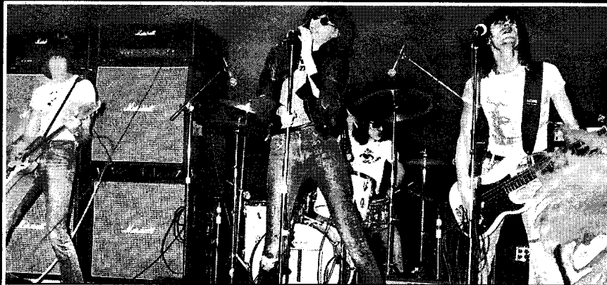
ROCK OF AGES: Rock-and-roll venue CBGB, hosting (clockwise from above) The Ramones, Deborah Harry of Blondie, and Patti Smith in the '70s, now faces a punishing rent hike.